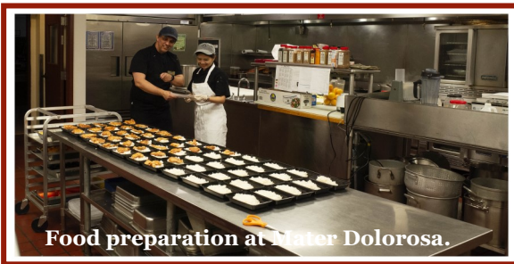
Food preparation at Mater Dolorosa.