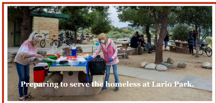
Preparing to serve the homeless at Lario Park.

In our desire to actively engage in helping those in need, our commercial kitchen was repurposed from serving our retreatants and guests to use by our kitchen staff in preparing, cooking, freezing and packaging nutritious meals for vulnerable homebound seniors and homeless individuals. Our Food Ministry Program helps to meet the needs of those whose meal services which were cancelled in response to the California Coronavirus social distancing requirements.