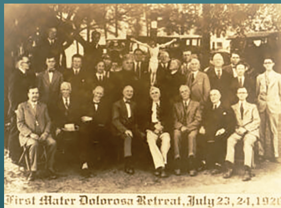
First Mater Dolorosa Retreat, July 23, 24, 1926

Although much has changed since 1926, the giant Moreton Bay fig still stands majestically in testimony to the days when 25 men gathered under its shade on a warm July weekend for the first retreat in Sierra Madre. †